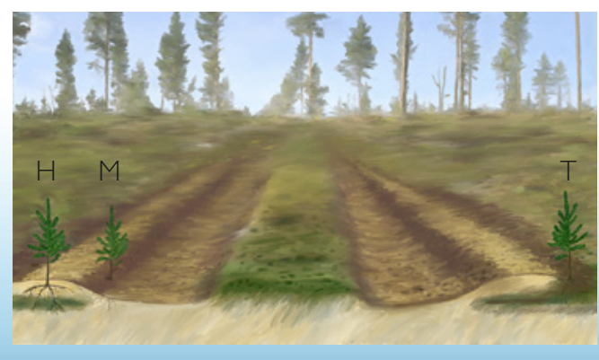
The Bracke T35.b creates planting spots with inverted humus (T), mineral soil mounds on inverted humus (H), and mineral soil mounds (M).