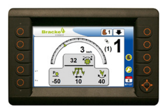
PLC based control system