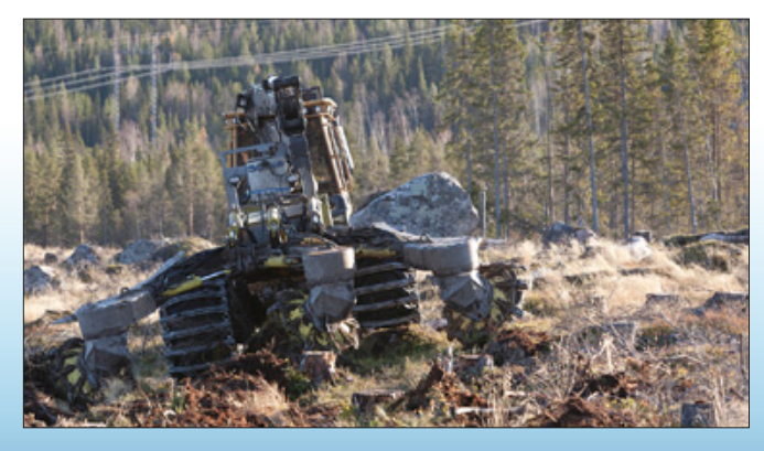
The Bracke T35.b is suitable for large scarification objects and is mounted on large prime movers.