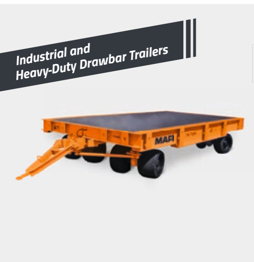
Industrial and Heavy-Duty Drawbar Trailers